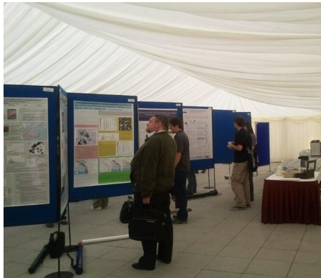
Marquee on the terrace

The marquee, if needed will give an extra 250sqm of exhibitor/networking space. All spaces are fully accessible