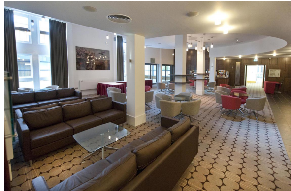
Centro Lounge area