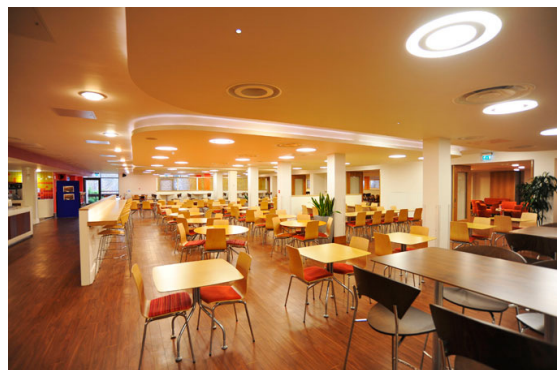
Conference Centre Restaurant

In the dining room delegates would be free to mingle and sit with who they choose. Their menus would include a variety of hot and cold options; Soups, salads, various main courses, desserts, cheeses, fruits etc. Unlimited hot and cold beverages.