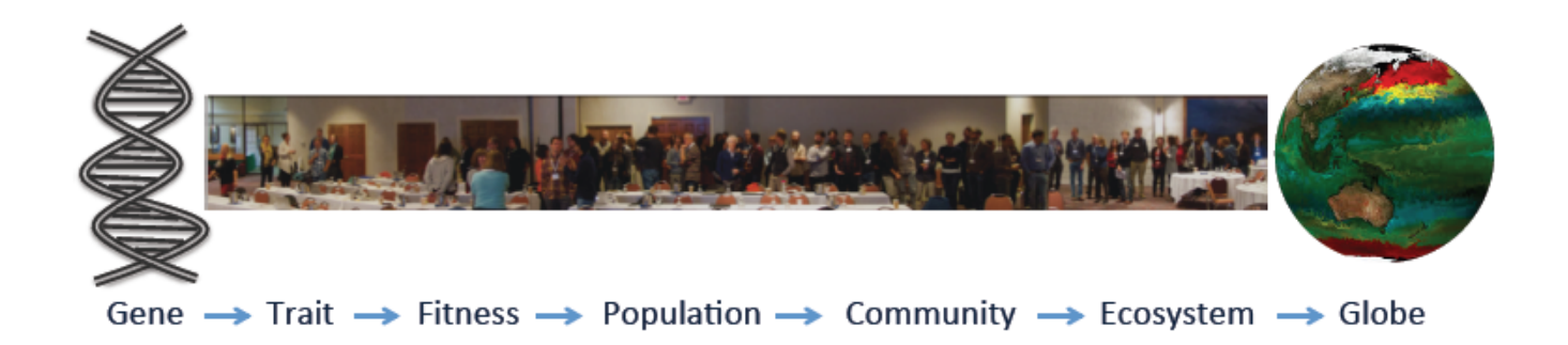
Figure 1. "From genes to global system". Workshop participants arranged by the scale at which their work fit on the spectrum, from gene to global ecosystem.